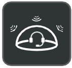
Acoustic Shield Technology

The Yealink WH62 is a new entry-level DECT wireless headset, with WH62 Dual and WH62 Mono two models. Work seamlessly with major UC platforms and integrate natively with Yealink IP phones. For crystal sound experience, Yealink Super Wideband Technology and Acoustic Shield Technology make you talk and hear clearly during phone calls and video conferencing. With easily on-ear control, interruption free, comfortable wearing, WH62 is a nice partner either for communicating or collaborating.