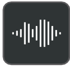
Optima Audio Experience