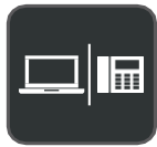
Multiple Devices Connection