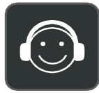
All Day Wearing Comfort