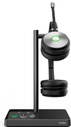
WH62 Dual Teams WH62 Dual UC

Based on hundreds of headform evaluations and thousands of wearing comfort tests, WH62 well meets the ergonomic requirements. Besides, with premier soft leather cushions and lightweight design, you can wear it all day comfortably. For more workspace freedom, WH62 can also free you up to 160m away from the desk.