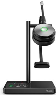
WH62 Mono Teams WH62 Mono UC